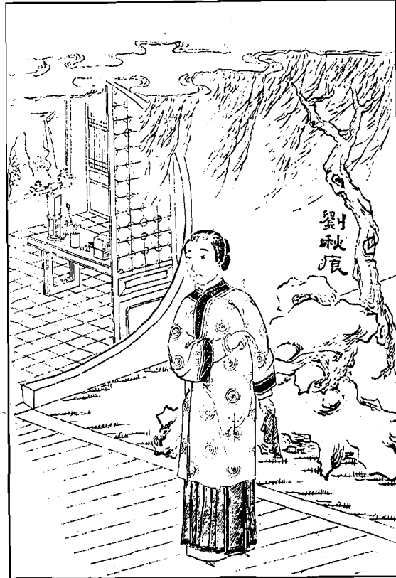
LIU CH'IU-HEN (same source).

to want to redeem the prostitute he loves so dearly; he is also too much concerned about his absent mother and too poor to properly attend to the task of negotiating for her freedom. In any event, as rumours circulate that he wants to buy Ch'iu-hen, her foster parents abduct her to another city. She nearly dies of dysentery on the road, but thanks to an accidental fire which kills her foster parents in a hotel, she manages to return to Taiyuan only to learn of her lover's recent death. Ch'iu-hen dies the same night by hanging herself from a tree. To Chinese readers immersed in sentimental-erotic literature, nothing is more beautiful or pathetic than a high-minded prostitute or concubine killing herself in this fashion to prove her fidelity to her lover. Hers is an act of hsün-ch'ing 殉情 or hsün-chieh 殉節.