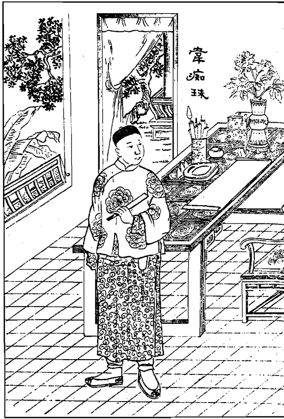
WEI CH'IH-CHU, from 1908 edition of Hua-yüeh hen .

and the actual unsettled conditions of China during the T'ai-p'ing Rebellion. Secondly, it exposed the sharp contrast between the forced gaiety of courtesans at wine parties and their gross maltreatment in the hands of pimps and bawds. The novel is certainly remarkable for extending our sympathy from the hapless young ladies of the Takuanyüan 大觀園 to the even worse situated prostitutes in nineteenth-century Taiyuan, Shansi.