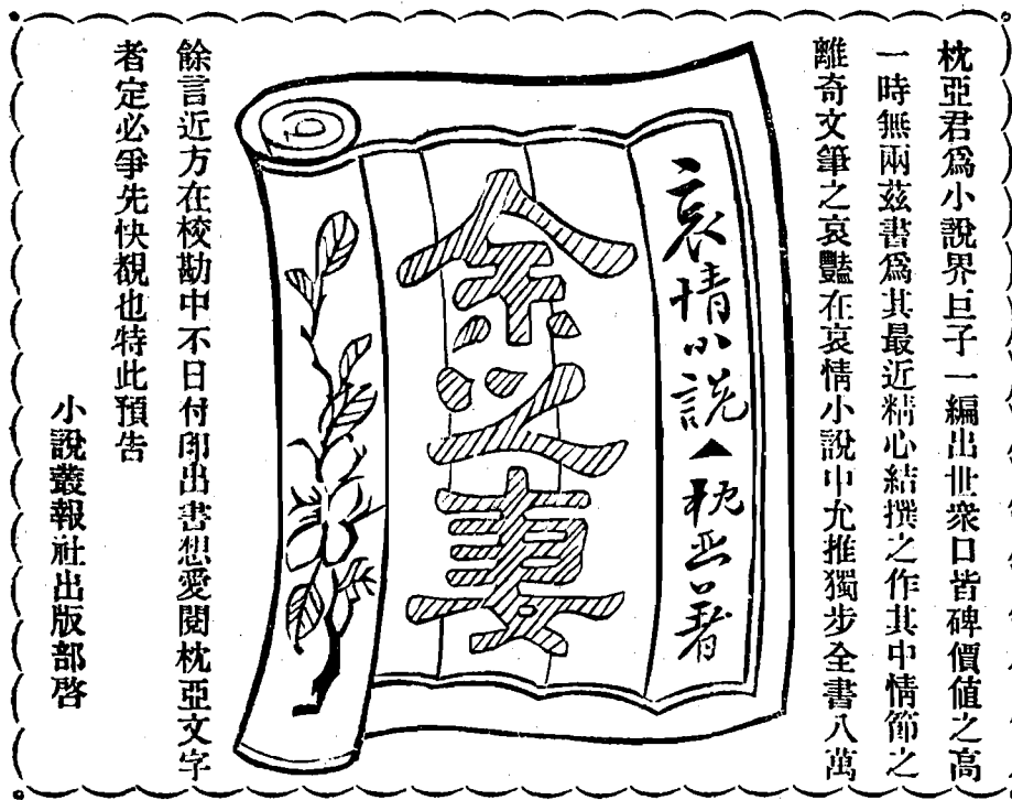
ADVERTISEMENT FOR MY WIFE, 余之妻 Hsiao-shuo ts'ung-pao , No. 19, 1916.

servants), Yü chih ch'i 余之妻 (My wife), and Hsüeh-hung lei-shih .