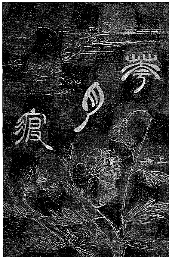
COVER OF HUA-YÜEH HEN (Traces of Flower and moon), lithographic edition, Shanghai 1908.